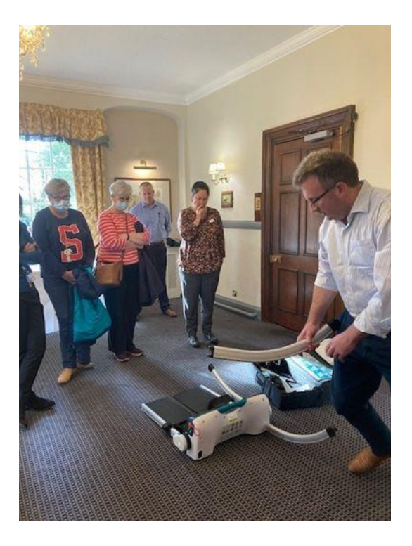
Demonstrating the Raizer chair lift to residents following a fall.

The room working together on different topics.