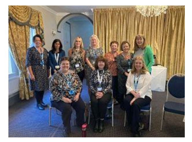
The IPC and QI team with Medicines Management team